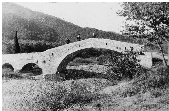
Fig. 1 - Bridge Andora . Andora Ponte medievale, particolare (AFIISL, Bordighera. Fondo Bicknell-Berry, 258).

It is easy to think of Clarence Bicknell, steeped in archaeology, botany, philanthropy, and Esperanto as an entirely work-driven man, a serious scholar to end all serious scholars, and indeed he