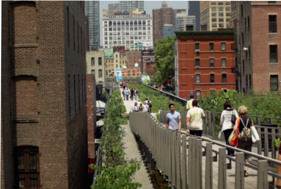
High Line, New York

If the trip to Brooklyn were not to entirely satisfy lovers of beautiful New York gardens, we would suggest a final visit to the northern most tip of Manhattan Island, to find Fort Tryon Park, with its wonderful mediaeval cloisters, bought in Europe by J. D. Rockefeller Jr., then taken apart and re-erected in this tranquil New York park, facing the calm waters of the Hudson River. A place of peace, silence and antique beauty. Entering the cloisters of the grand neo-mediaeval complex, one is momentarily disoriented, transported as if by magic from New York to the heart of Burgundy or Murcia.