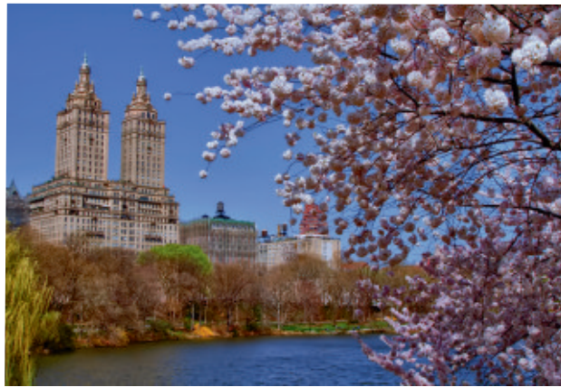
New York, Central Park, Cherry blossom

created by the landscape artist Takeo Shiota between 1914 and 1915. The garden in Brooklyn was the first public Japanese garden in North America, established around a small lake, on the edge of which was erected a large sacred Shinto shrine (torii), brought from Japan, and whose piles are sunk into the lakebed, as are those of the most famous torii in the whole of Japan, on