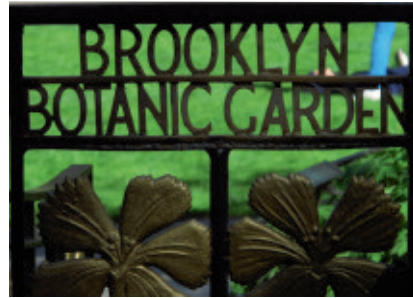
Brooklyn Botanic Gardens, the gate

After the cold wet winters of New England, towards the end of April the park reawakens and begins to attract numerous visitors at the time of the annual flowering of around 200 examples of cherry, celebrated by the hanami, the traditional Japanese festival which marks flowering, somewhat like the Cherry Blossom Festival in Washington. In fact the Brooklyn gardens have retained, unchanged, their special bond with Japanese botanic and horticultural culture. It is probably fair to say that the very heart of the park lies around the small garden and artificial lake