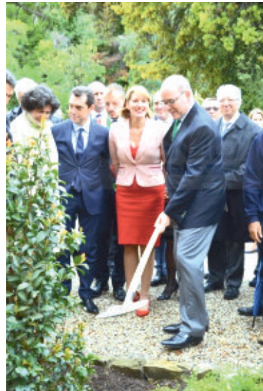
Albert II of Monaco planting a camellia in occasion of his visit in the Hanbury Garden