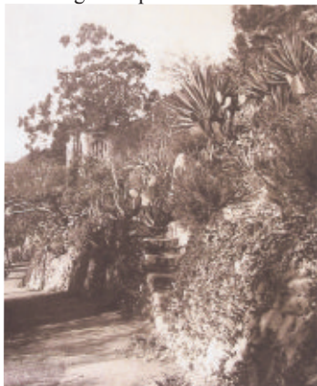
Boccanegra when belonged to Ellen Willmott