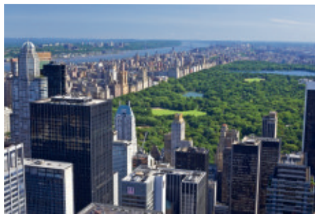
New York, Central Park South

More recently, in Manhattan, newspaper articles have featured the intelligent restoration and reuse of the old elevated railway line (the High), which used to run between 10th and 11th Avenue in Chelsea. After falling into disuse in the late 1970s it was slowly colonized by spontaneous and disordered plant growth, making its way along the steel rails and wooden cross-ties of the old line. Out of these early beginnings came the idea of following the