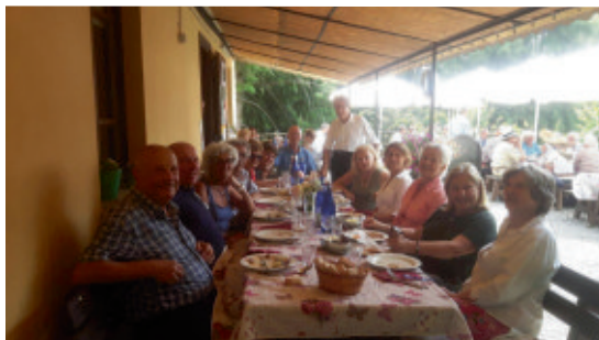
trip to Pollone

2017 has been particularly eventful thanks to the 150th anniversary of Thomas Hanbury's acquisition of the property. The highlight of the celebrations were on the 6th and 7th of May. In addition the Friends of Hanbury continued with their usual activities.