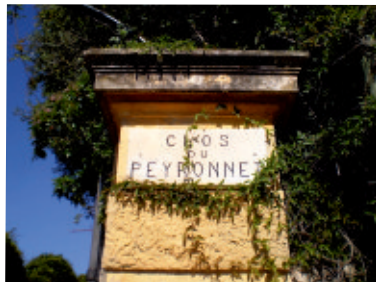
Clos du Peyronnet - entrance

Other striking parts of this garden are: the central feature of a water staircase consisting of five ponds falling away from consecutive terraces, a small orchard of exotic fruit trees including the rare "rose apple" or Jaboticaba, a clump of magnificent yellow bamboo and about 8 avocado trees of various varieties. The whole garden exudes harmony and creativity.