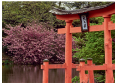
Brooklyn Botanic Garden, the torii

There have always been other, smaller green spaces in Manhattan, such as the collection of gardens of Bryant Park, the one next to the New York Public Library, Madison Square Park and Washington Square. There are also several mossy cemeteries flanking colonial-era churches and for more than a century swallowed up by high-rise Downtown and Midtown.