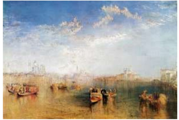
Turner: Giudecca, La Donna della Salute and San Giorgio, 1841