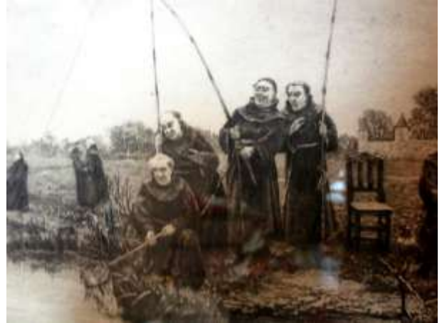
Image in St Peters, Stoke-upon-Tern. These may or may not be Corbet's missioner priests

The brotherhood consisted of twelve astonishingly well-educated men, missioner priests , living in an open community, as opposed to a closed monastery. The parish house itself was spacious enough to host conferences and retreats attended by theologians, priests and interested participants who arrived from all over the country – and even from abroad. The stables and carriage houses were located on the south side of the parish house, with a forge close by, much used owing to the frequent missionary journeys the brothers undertook on horseback or in horse-drawn carriages. Clarence himself went on missions to Edinburgh in 1874 and 1875 to found a temperance society on the lines of the one he ran at Stoke-upon-Tern which he named The Guild of the Holy Redeemer .