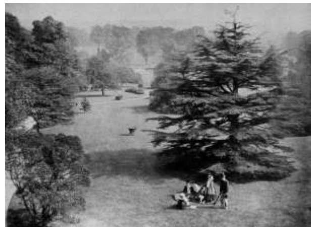
The park of Bicknell's house Herne Hill