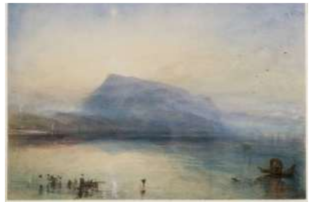
Turner: Blue Rigi, 1842